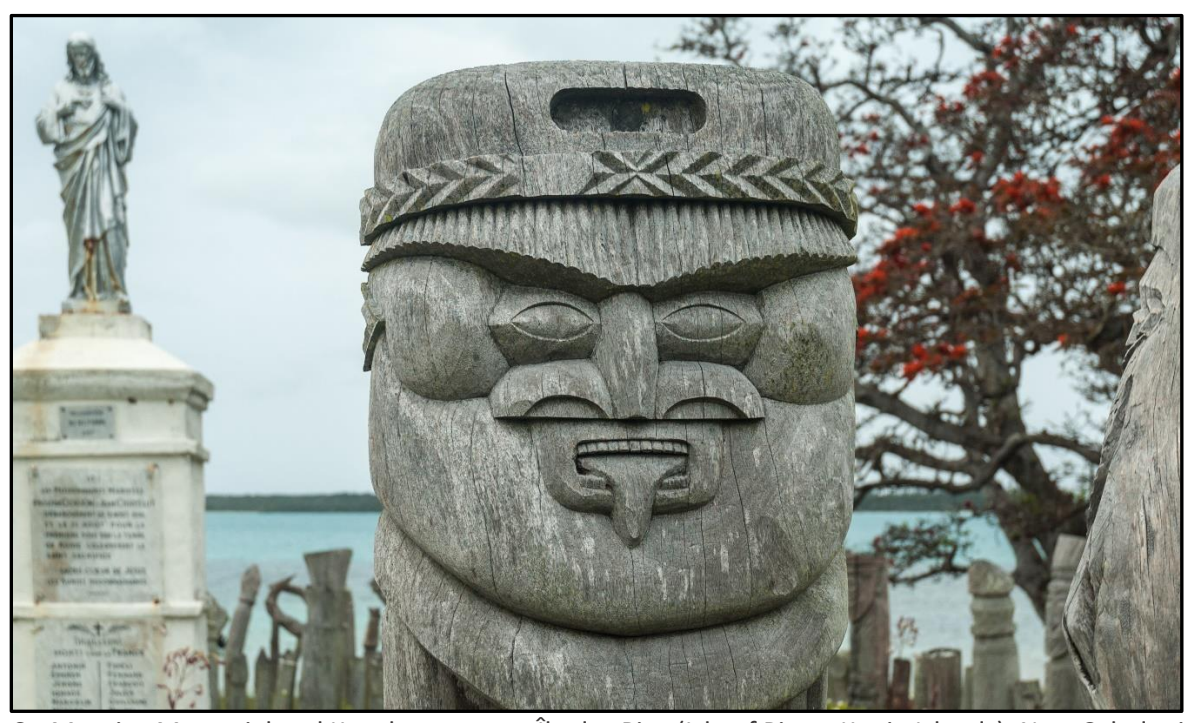
St. Maurice Memorial and Kanak totems on Île des Pins (Isle of Pines, Kunie Islands), New Caledonia.

Laurel Point Inn · Victoria, BC · Nov. 3-5, 2022